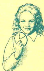
at all times